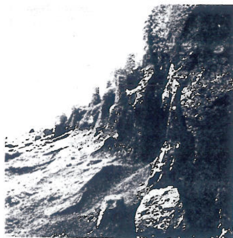
Figure 3. Indurated ash-flow tuff on north side of Tugamak Range.

A somewhat different proposal has been put forward by Aramaki and Ui (1966) and Ono (1965) to explain the puzzling occur-